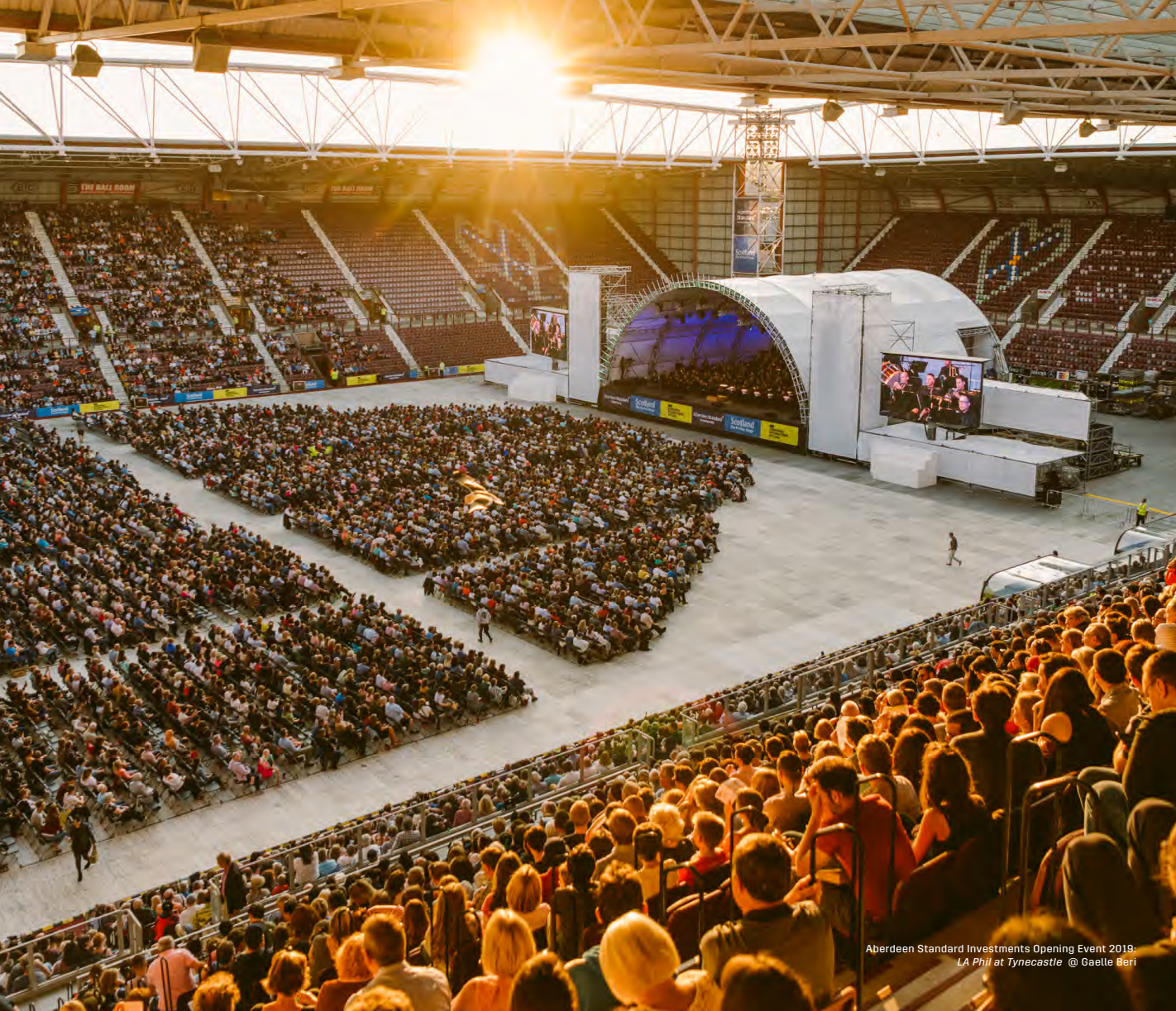
Aberdeen Standard Investments Opening Event 2019: LA Phil at Tynecastle