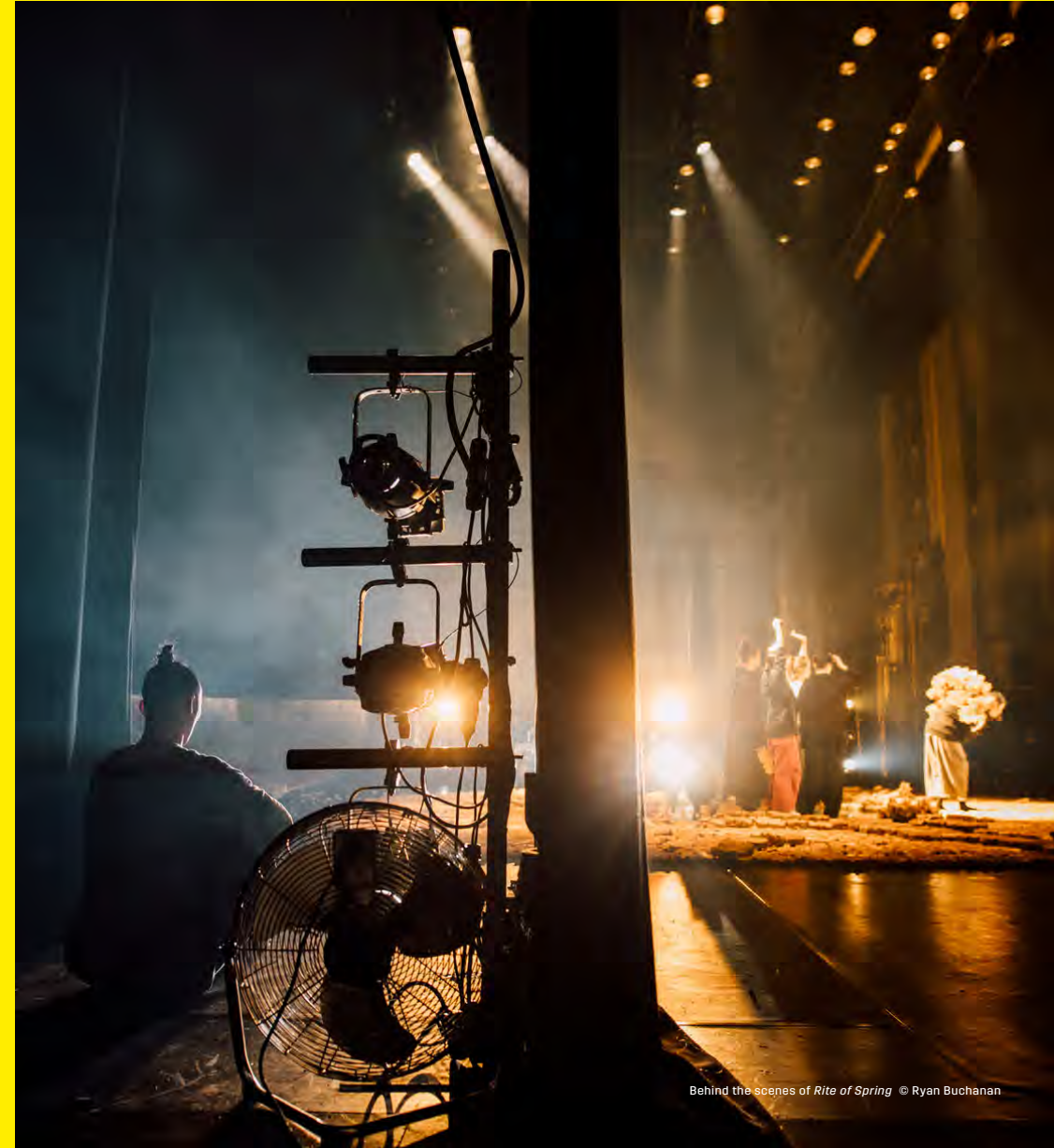
Behind the scenes of Rite of Spring

We are committed to enriching people's lives through the arts and contributing to the cultural and social life of the City of Edinburgh and Scotland.