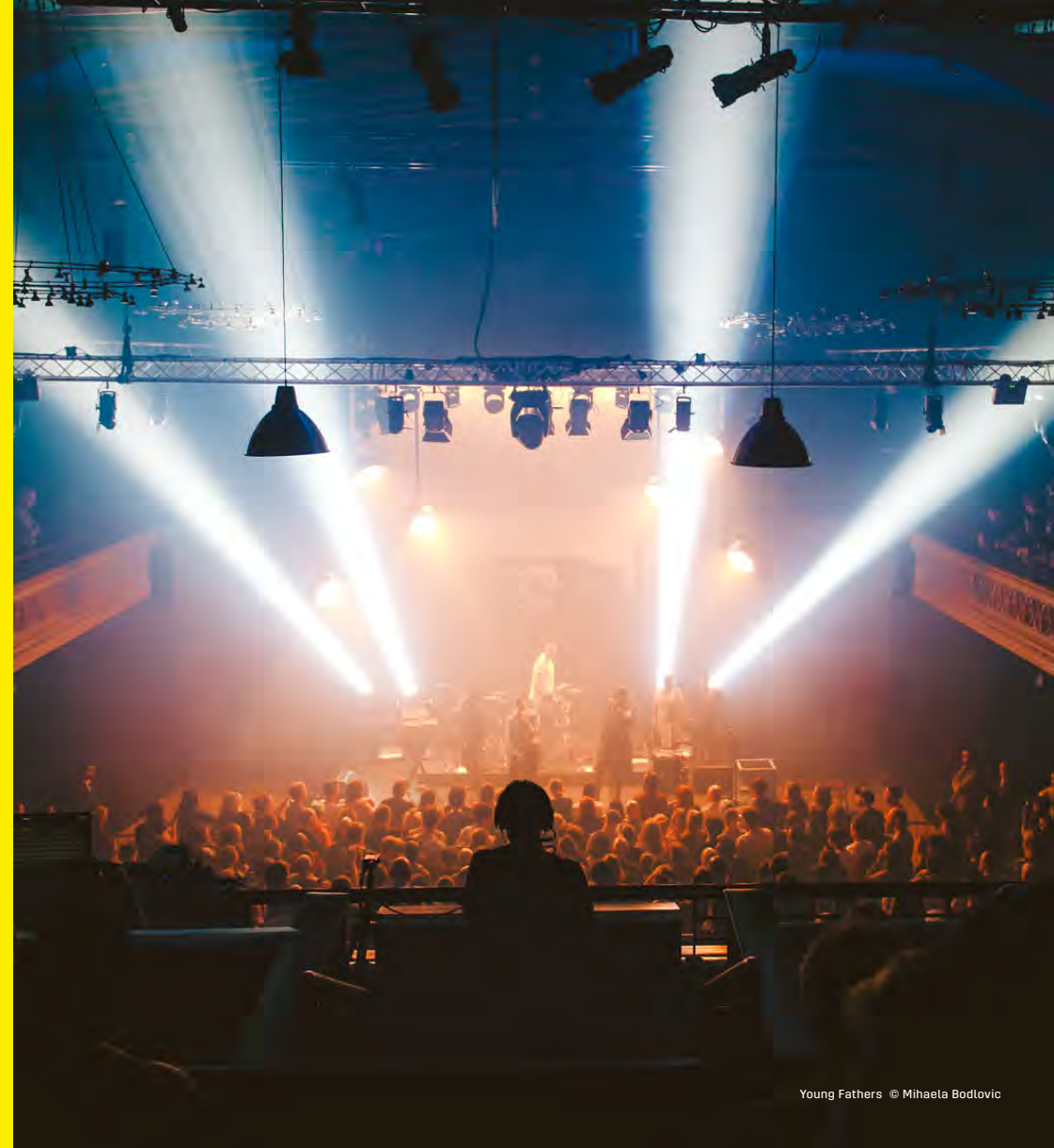
Young Fathers

We are committed to sharing our knowledge and expertise, creating opportunities for student placements, apprenticeships, training and volunteering. Our partners can help us develop these programmes and offer a vital cross-sector perspective.